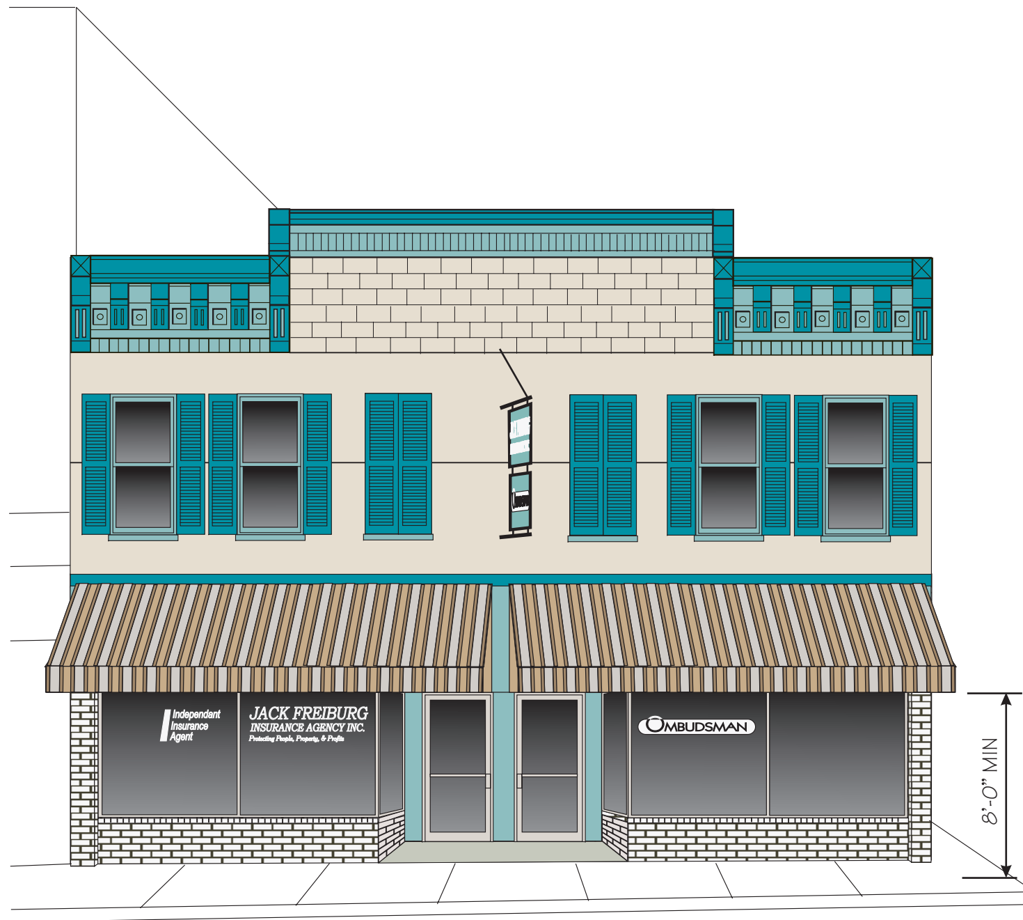
PROPOSED DESIGN (OPTION 1)