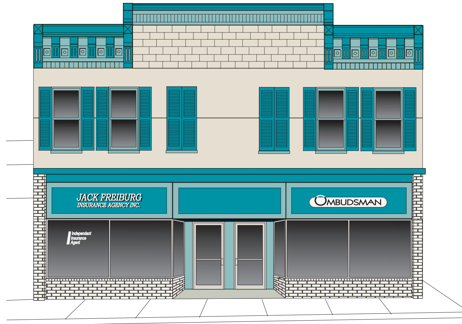
PROPOSED DESIGN (OPTION TWO)

NOTE: The Illinois MAIN STREET Program, through the Illinois Historic Preservation Agency, has provided this free design assistance to qualified property/ business owners in the officially designated MAIN STREET project areas. The rendering on this sheet is a conceptual view of the facade renovation based on information supplied to the staff architect. Should obscured architectural details or problems be revealed during the work, the local project manager and/or the staff architect should be consulted.